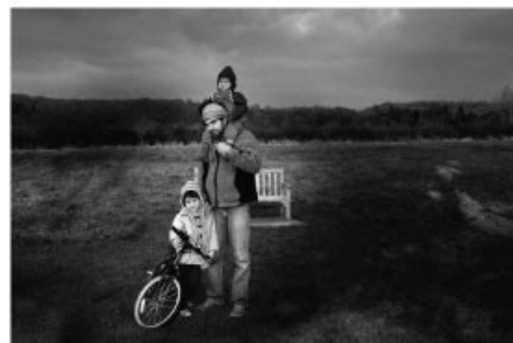
Family Portraits | The Guild gallery, mumbai (Work in Progress)