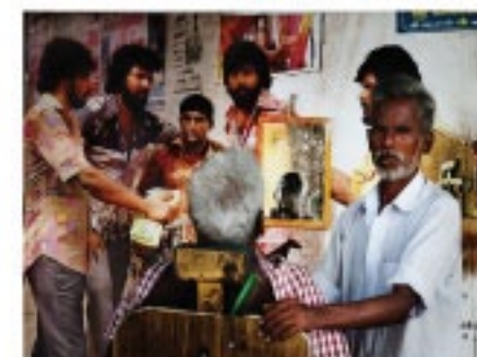
Workers (Work in Progress)